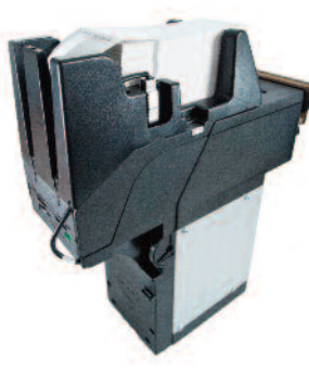
Fan Fold Top