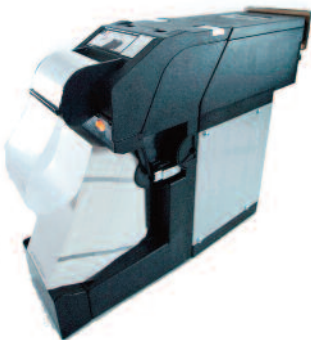
Fan Fold Rear